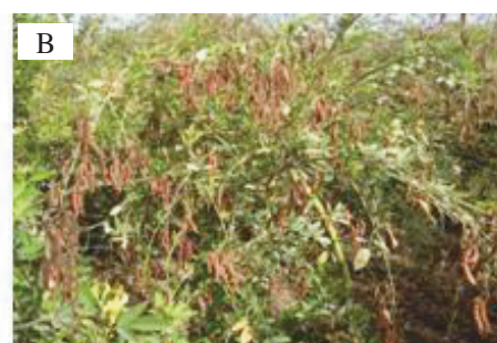
Fig. 3 (A-B)

A. Eight-months old pigeonpea germplasm grow out