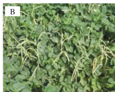
Fig. 2 (A-B)

A. Cowpea germplasm evaluation for adaptation and yield potential