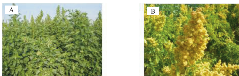
Fig. 1 (A-B)

Quinoa is an annual herb which produces light yellow to pink seeds in large sorghum-like clusters (Figure 1.A-B). Quinoa is thought to have originated in the high mountain plains of the Andes in Peru and Bolivia. The genetic variability of quinoa is reportedly huge, with cultivars adapted to growth from sea level to 4000 m above sea level, from 40°S to 2°N latitude, and from cold, highland climates to subtropical conditions, making it possible to select, adapt, and breed cultivars for a wide range of environmental conditions. The main uses of it are for cooking, baking, etc.; modified food products such as breakfast cereals, pasta, and cookies; and the industrial use of starch. Quinoa seeds are highly nutritious with outstanding protein quality and high amounts of a range of vitamins and minerals (Schlick and Bubenheim, 1996; Jacobsen, 2003; Bhargava, et al. 2006). The protein content in grain ranges from 7.5 to 22.1% with an average of 13.8% (Cardozo and Tapia, 1979). Because of its exceptional nutritional quality, quinoa has been selected by the Food and